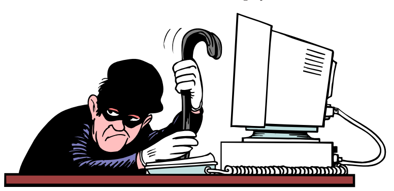
Theives these days don't use a crowbar to steal your money; they simply log onto the Internet. Never give out any personal information through e-mail.

Nov. 7, 2007 — In a variation, an e-mail scam claims to come from the IRS and the Taxpayer Advocate